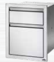
18" X 24" WASTE BIN DRAWER AND PAPER TOWEL HOLDER BI-1824-1W