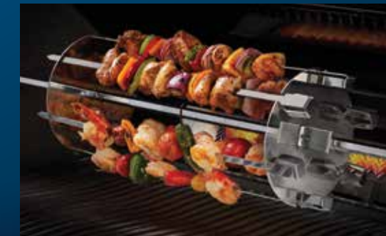
ROTISSERIE SHISH-KEBAB SKEWER SET 64008