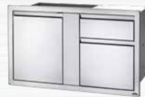
42" X 24" SINGLE DOOR & DOUBLE DRAWER BI-4224-1D2DR