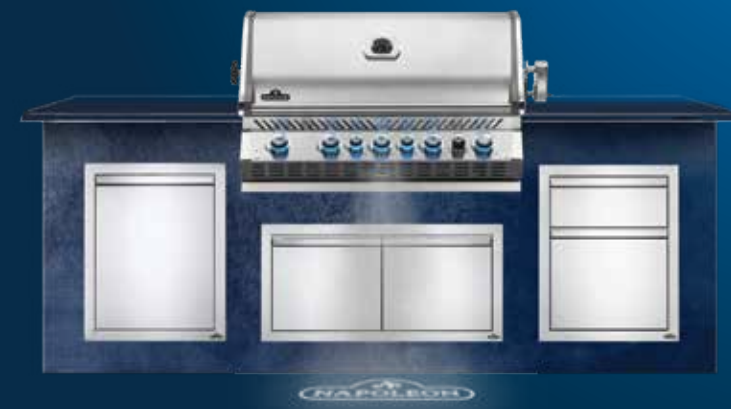
Proximity light included on PRO models only