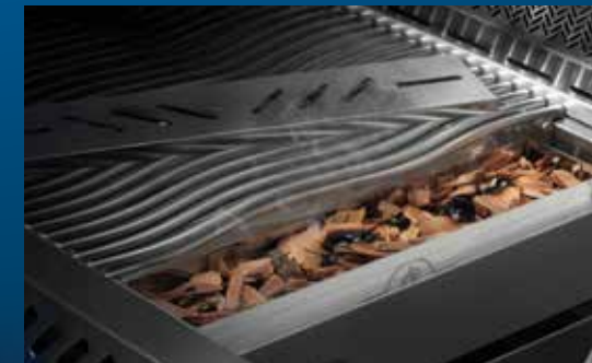
STAINLESS STEEL SMOKER BOX 67013