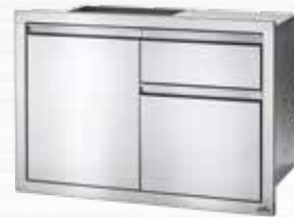
36" X 24" SINGLE DOOR & DOUBLE DRAWER BI-3624-1D2DR