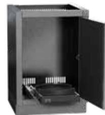
PROPANE TANK OR UNIVERSAL CABINETS IM-UTC-CN (SHOWN), IM-UDC-CN LEFT OR RIGHT OPENING