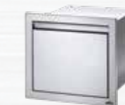
18" X 16" SINGLE DRAWER BI-1816-1DR