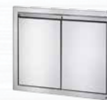
30" X 24" DOUBLE DOOR BI-3024-2D