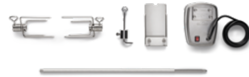
ADD-ON ROTISSERIE KIT WITH 2PC ROTISSERIE FORKS AND COMMERCIAL QUALITY MOTOR DESIGNED FOR: BUILT-IN 44" GRILL (BIG44RB) 69851