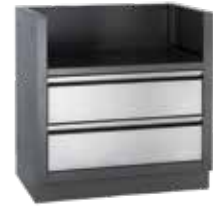
UNDER GRILL CABINET FOR BIG32 & BI32 IM-UGC32-CN