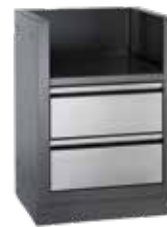
UNDER GRILL CABINET FOR BIB18IR, BIB18RT & BIB18PB IM-UGC18-CN