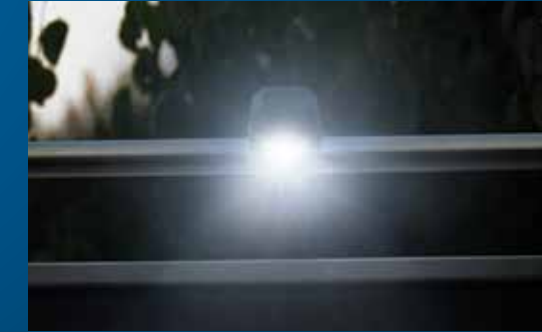
GRILL LIGHT 70049