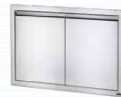
36" X 24" DOUBLE DOOR BI-3624-2D