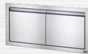
36" X 16" SMALL DOUBLE DOOR BI-3616-2D