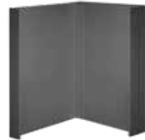
FRIDGE END PANEL IM-FEP-CN