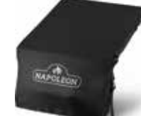
BUILT IN SIDE BURNER COVER FOR 12" (BIB12IR, BIB12RT & BI12RT) 61812