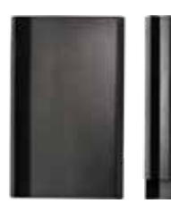
OASIS™ 45° LARGE TRANSITION PIECE IM-45LT-CN DESIGNED FOR: BIPRO665, BIPRO825 AND 18" BURNERS