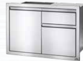
36" X 24" SINGLE DOOR & WASTE BIN DRAWER AND PAPER TOWEL HOLDER BI-3624-1D1W