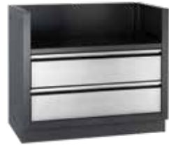
UNDER GRILL CABINET FOR BIG38RB IM-UGC38-CN