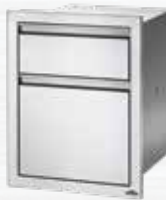
18" X 24" DOUBLE DRAWER BI-1824-2DR