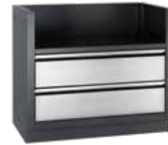
UNDER GRILL CABINET FOR BIPRO500RB & BIP500RB IM-UGC500-CN