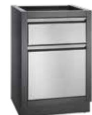
WASTE DRAWER WITH PAPER TOWEL HOLDER IM-WDC-CN