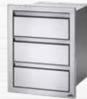
18" X 24" TRIPLE DRAWER BI-1824-3DR