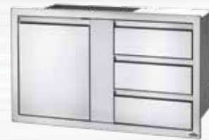
42" X 24" SINGLE DOOR & TRIPLE DRAWER BI-4224-1D3DR