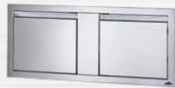
42" X 16" DOUBLE DOOR DESIGNED FOR: BUILT-IN 44" GRILL (BIG44RB) BI-4216-2D