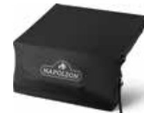
BUILT IN SIDE BURNER COVER FOR 18" (BIB18PB, BIB18IR & BIB18RT) 61818