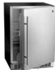
OUTDOOR RATED STAINLESS STEEL FRIDGE NFR0550USS