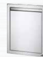
18" X 24" SINGLE DOOR BI-1824-1D