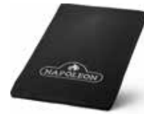
BUILT IN SIDE BURNER COVER FOR 10" (BIB10IR, BIB10RT & BI10RT) 61810