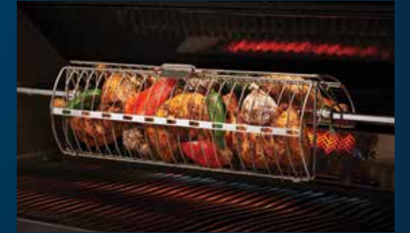
ROTISSERIE RACK 64005