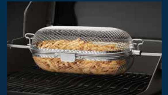
ROTISSERIE GRILL BASKET 64000