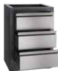
THREE DRAWER CABINET IM-3DC-CN