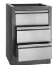
TWO DRAWER CABINET IM-2DC-CN