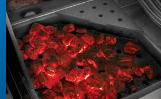
CAST IRON CHARCOAL AND SMOKER TRAY 67732

✓ Outdoor cooking accessories that fit all Built-In Series Grills