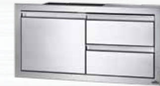
36" X 16" SINGLE DOOR & DOUBLE DRAWER CABINET DESIGNED FOR: BUILT-IN 38" GRILL (BIG38RB) BI-3616-1D2DR