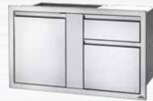
42" X 24" SINGLE DOOR & WASTE BIN DRAWER AND PAPER TOWEL HOLDER BI-4224-1D1W