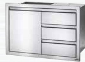
36" X 24" SINGLE DOOR & TRIPLE DRAWER BI-3624-1D3DR