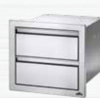
18" X 16" DOUBLE DRAWER BI-1816-2DR