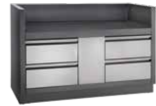
UNDER GRILL CABINET FOR: BIPRO825RBI IM-UGC825-CN