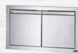
30" X 16" DOUBLE DOOR DESIGNED FOR: BUILT-IN 32" GRILL (BIG32RB) BI-3016-2D