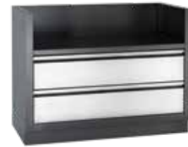
UNDER GRILL CABINET FOR BIG44RB IM-UGC44-CN