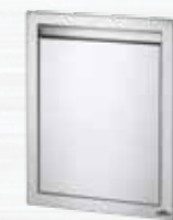
18" X 24" REVERSIBLE SINGLE DOOR BI-1824-1DR