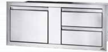
42" X 16" SINGLE DOOR & DOUBLE DRAWER DESIGNED FOR: BUILT-IN 44" GRILL (BIG44RB) BI-4216-1D2DR